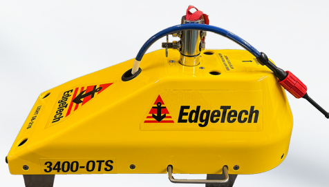
3400-OTS ULTRA & LIGHT WEIGHT